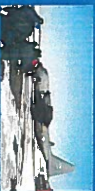
413 Squadron Greenwood, Nova Scotia CC-130 Hercules CH-149 Cormorant

CASARA Newfoundland and Labrador members support: