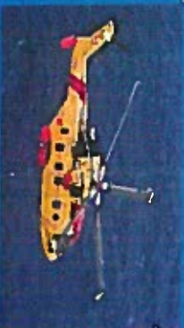
103 Squadron Gander, Newfoundland CH-149 Cormorant

CASARA helps the military train their own crews by: