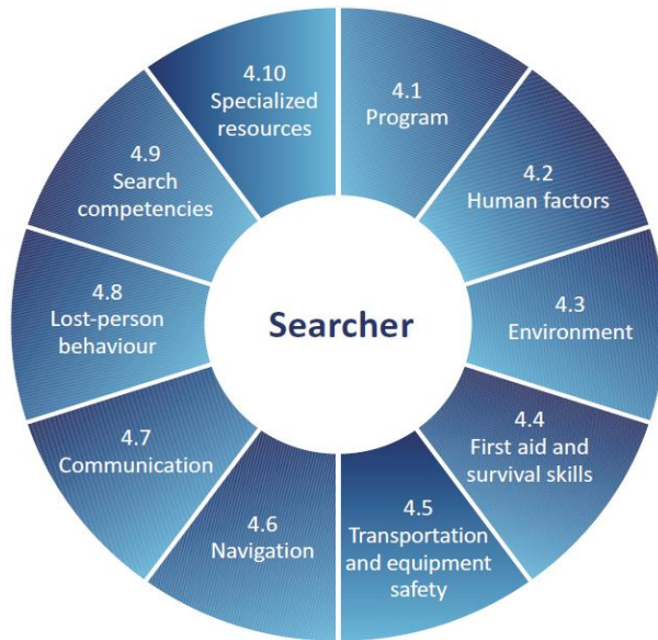
Figure 1: SAR Responder Curriculum Standard (CSA Group)